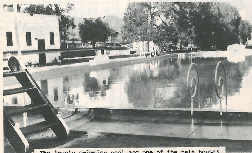
The lovely swimming pool and one of the bath houses.