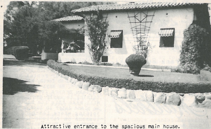
Attractive entrance to the spacious main house.

So security worth having is that from within, that which you gain in the years from youth to maturity. When we learn that, we know the secret of the ages, the secret that brings inner peace, inner prosperity, inner security that stands against all material things. This comes not easily, but only through study, observation, meditation and prayer. But it is worth having. It is from the Father.